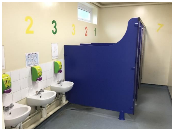
Our class toilets