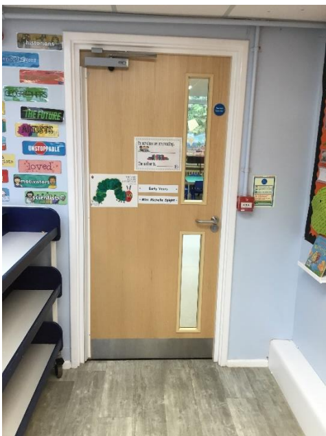
Our classroom door